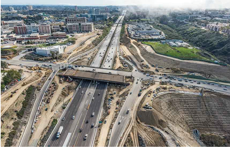
The five-lane Genesee Avenue bridge over I-5 in San Diego is being replaced with a new 10-lane overcrossing.